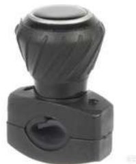
Wheel Spinner KR-WST108KR