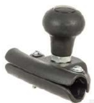
Wheel Spinner KR-WST110KR