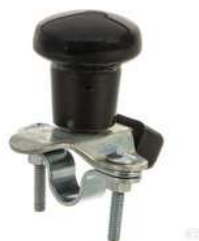
Wheel Spinner KR-WST109KR