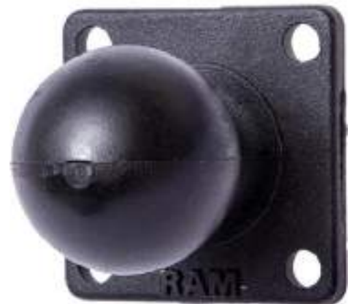
4 Hole Square Plate Adapter 1.5" x 1.5"

Hole Pattern: 4-Hole AMPS: 1.181" x 1.496"