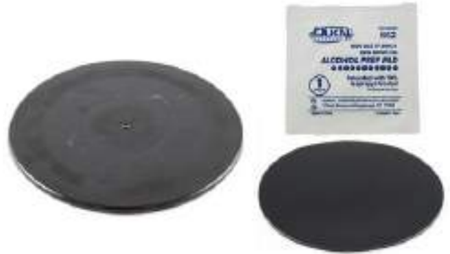
3.5" Adhesive Dashboard Base for Suction Cups MI-RAP-350-35B

Base Diameter: 6.5" Diameter Suction Platform: 3.5" Diameter Weight Capacity: 0.9kg (2 lbs) Dimensions: 6.5"W x 1.25"H x 6.5" D