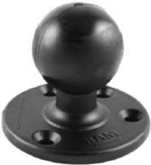
RAM Large Round Plate with Ball