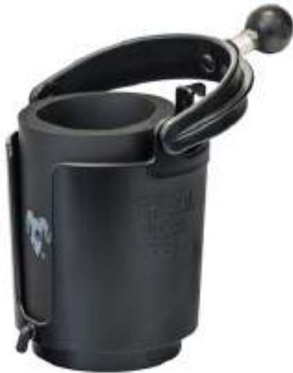
RAM Level Cup 160Z Drink Holder