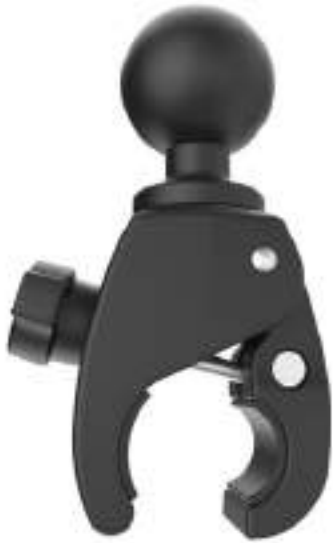
RAM 0.625" to 1.5" Diameter Tough-Claw Base KR-RAP400

Ball/Socket Size: 1.5" Clamp Range: 0.625" - 1.14" Diameter Weight Capacity: 1.8kg (4 lbs)