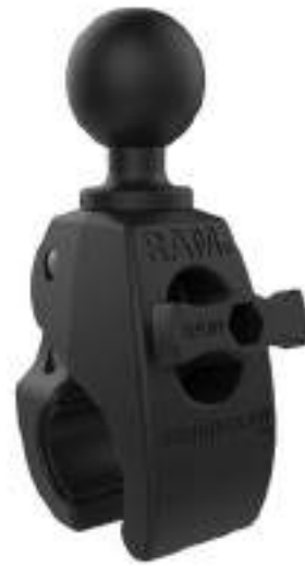
RAM 1" to 1.6" Diameter Tough-Claw Base KR-RAP404U

Ball/Socket Size: 1.5" Clamp Range: 0.625" - 1.14" Diameter Weight Capacity: 1.8kg (4 lbs)