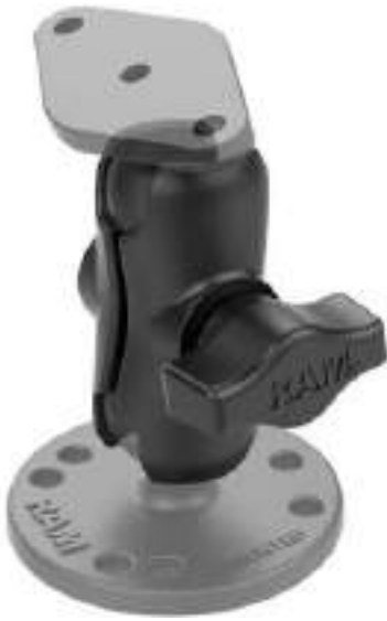
2.42" (60mm) Short Socket