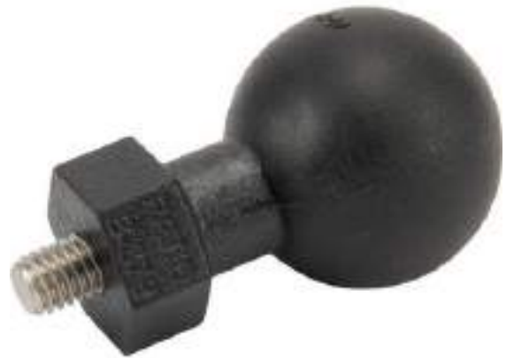
RAM Tough-Ball M6-1 x 6mm Threaded Stud