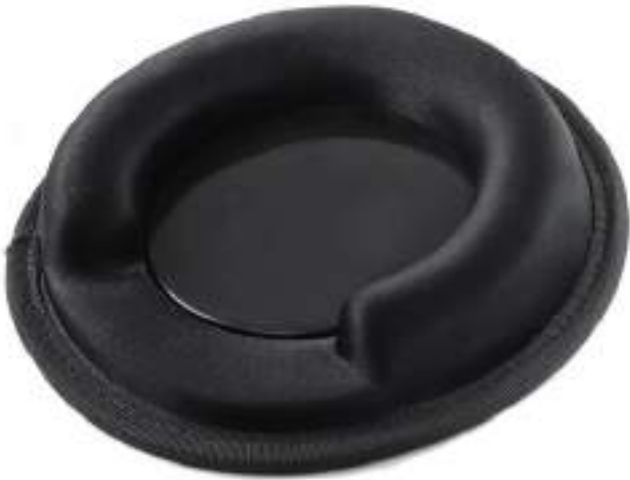
Portable Friction Dashboard Base for Suction Cups MI-RAP-279C

Base Diameter: 6.5" Diameter Suction Platform: 3.5" Diameter Weight Capacity: 0.9kg (2 lbs) Dimensions: 6.5"W x 1.25"H x 6.5" D