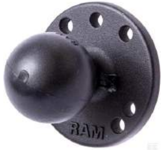
4 Hole AMPS Round Plate Adapter