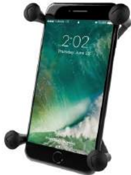
RAM X-Grip Holder for Phones up to 4.5" wide