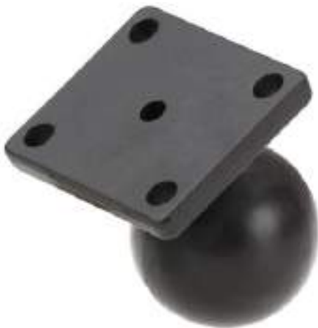
4 Hole AMPS Rectangular Plate Adapter