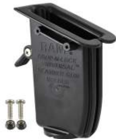
RAM Drop-N-Lock Universal Scanner Gun Holder MI-RAP-317U