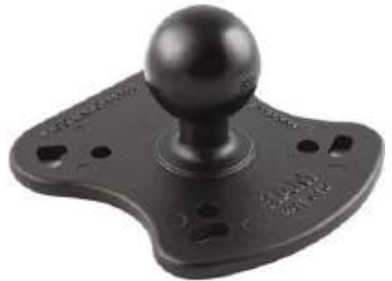
RAM Mounting Plate 4.25" x 3.81" KR-RAMC107B

Ball/Socket Size: 1.5" Total Length: 120.7mm Weight Capacity: 1.8kg (4 lbs)