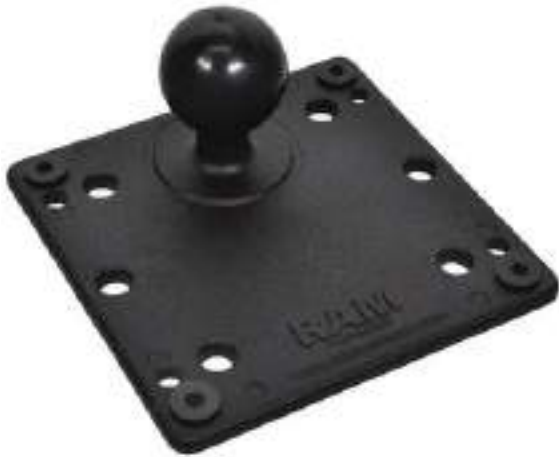
RAM 100 x 100mm VESA Plate with Ball KR-RAMC246U

Ball/Socket Size: 1.5" Total Length: 75mm Weight Capacity: 1.8kg (4 lbs)