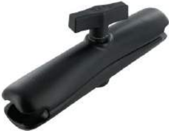
9.13" (235mm) Long Socket Arm