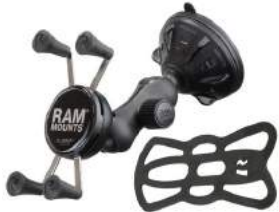
Twist-Lock Suction Cup C/W RAM X-Grip Phone Holder KR-RAPB1662UN7

Ball/Socket Size: 1" Suction Size: 3.3" Diameter Weight Capacity: 0.9kg (2 lbs) Width Range: 1.875"-3.25" Depth Range: 0.875" Max