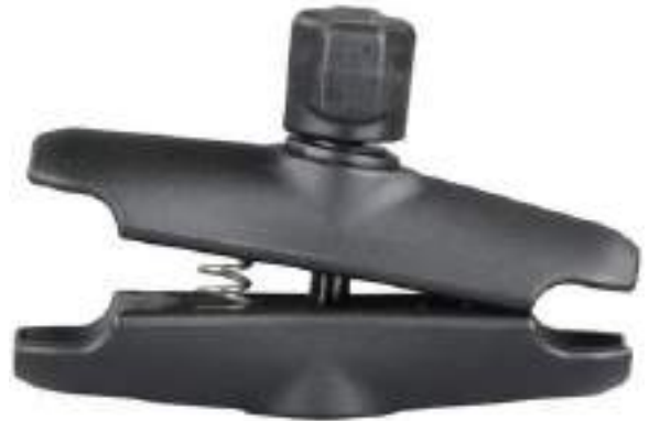
3.73" (95mm) Medium Socket Arm