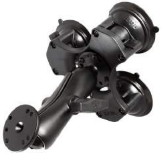
Twist-Lock Triple Suction Cup Mount C/W Round Plate