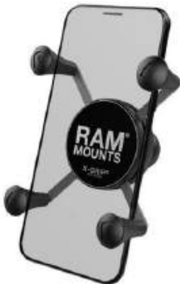
RAM X-Grip Holder for Phones up to 3.25" Wide