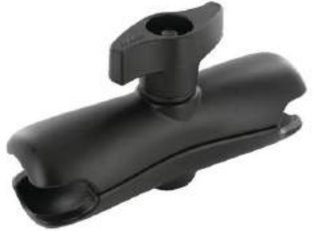
RAM Double Socket Arm Medium 215mm