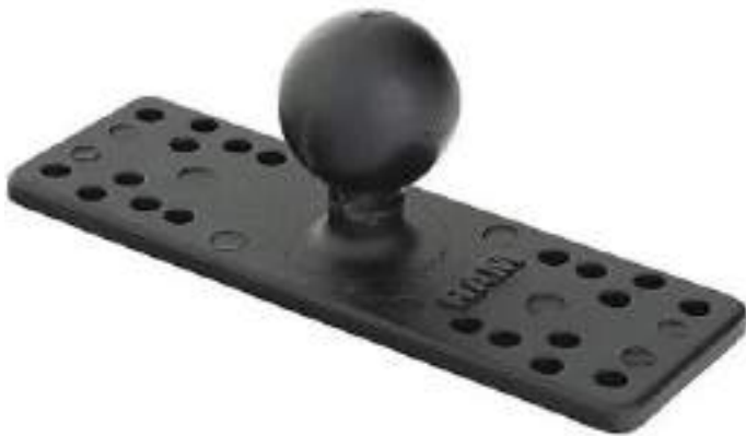
RAM Mounting Plate 6.25" x 2"