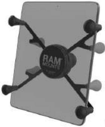
RAM X-Grip Holder for 7"-8" Tablets