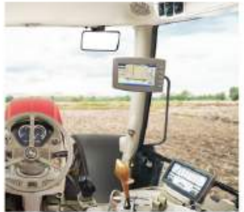
Device Adapter Socket Arm Threaded Ball Base