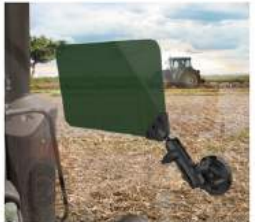
Sun Visor Socket Arm RAM® Twist-Lock™ Suction Cup