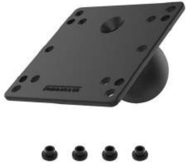
RAM 100 x 100mm VESA Plate with Ball