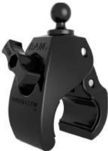
1" to 2.25" Diameter RAM Tough-Claw Base MI-RAP-B-401

Ball/Socket Size: 1" Clamp Range: 1" - 1.875" Diameter Weight Capacity: 0.9kg (2 lbs)