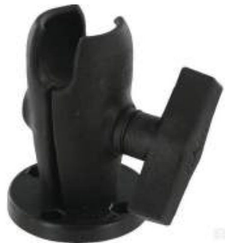
RAM Single Socket Arm with Round Plate KR-RAPC2001293U

Ball/Socket Size: 1.5" Clamp Range: 25-57mm Total Length: 166.6mm Weight Capacity: 1.8kg (4 lbs)