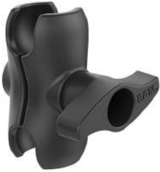
RAM Double Socket Arm Short 130mm