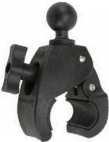
RAM 1" to 2.25" Diameter Tough-Claw Base KR-RAMC401P

Ball/Socket Size: 1.5" Clamp Range: 1" - 1.6" Diameter Weight Capacity: 1.8kg (4 lbs)