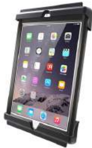
RAM Tab-Tite Holder for 9"-10.5" Tablets with H/D Cases MI-RAM-HOL-TAB20U