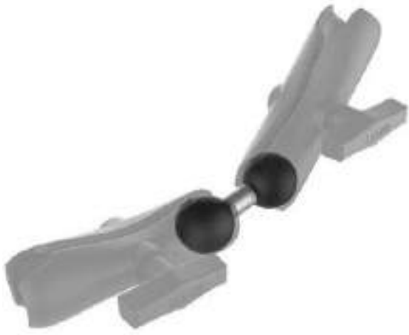
RAM Double Ball Adapter KR-RAMC230

Ball/Socket Size: 1.5" Total Length: 57mm Weight Capacity: 1.8kg (4 lbs)