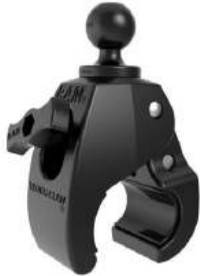
1" to 1.875" Diameter RAM Tough-Claw Base KR-RAMB404P

Ball/Socket Size: 1" Clamp Range: 0.625" - 1.14" Diameter Weight Capacity: 0.9kg (2 lbs)