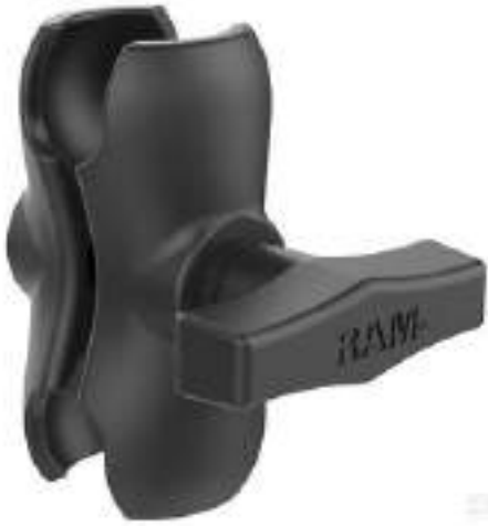
3.56" (90mm) Short Socket Arm