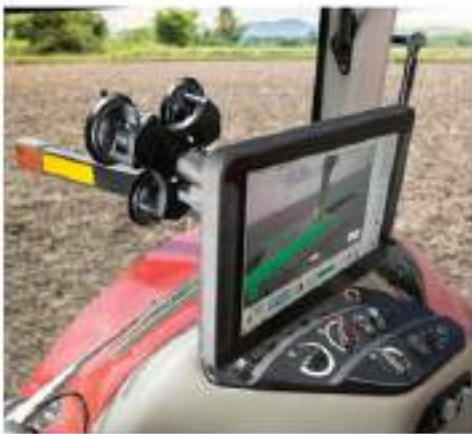
Device Adapter Socket Arm RAM® Twist-Lock™ Suction Cup