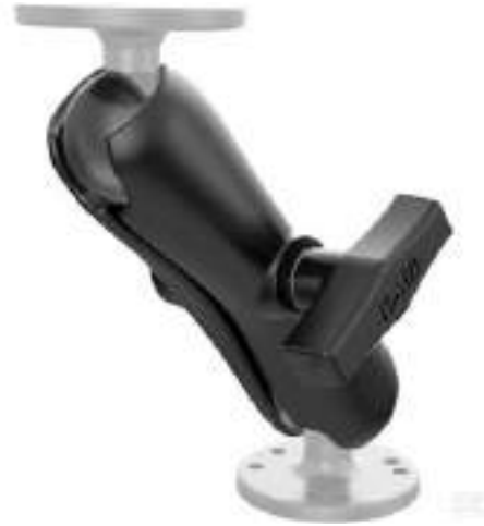
5.69" (145mm) Medium Socket Arm