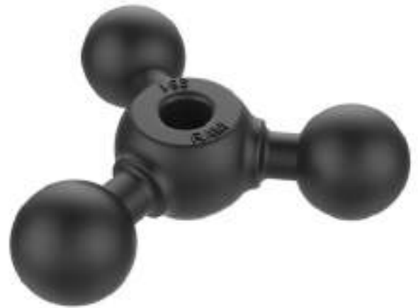
RAM Triple Ball Adapter KR-RAM289U

Ball/Socket Size: 1.5" Total Length: 57mm Weight Capacity: 1.8kg (4 lbs)