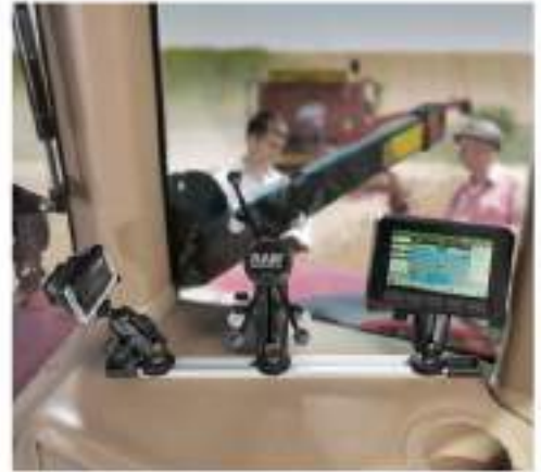
Device Cradles and Adapters Socket Arms RAM® Track Ball™ RAM® Tough-Track™