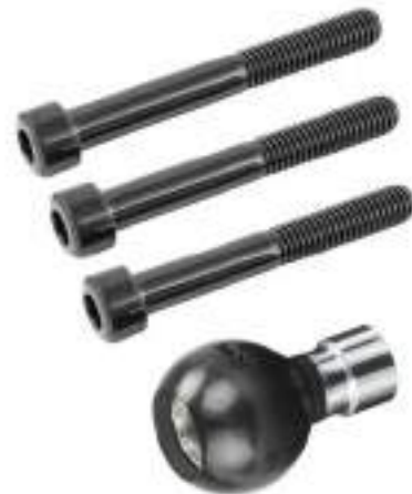
RAM Motorcycle Handlebar Clamp Base with M8 Bolts KR-RAMB367

Ball/Socket Size: 1" Clamp Range: 1" - 2.25" Diameter Weight Capacity: 0.9kg (2 lbs)