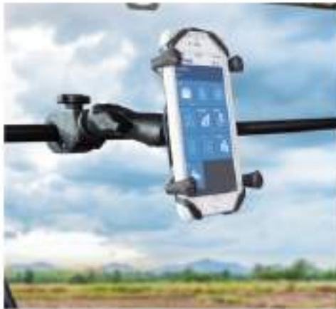
RAM® X-Grip® Phone Mount Socket Arm RAM® Tough-Claw™