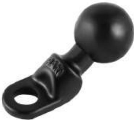
9mm Angled Bolt Head Adapter Ball Base KR-RAMB272

Ball/Socket Size: 1" Weight Capacity: 0.9kg (2 lbs) Material: Marine-Grade Aluminum