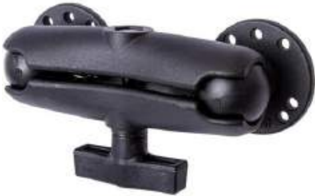
Mount C/W 2 RAM-202 & Arm