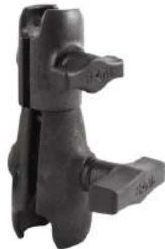
RAM B Size to C Size Socket Socket Arm