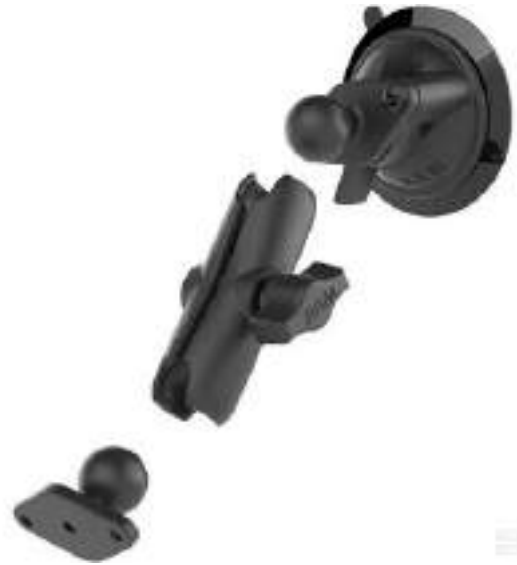
Twist-Lock Suction Cup Double Ball Mount KR-RAMB166

Diameter: 1" Weight Capacity: 0.9kg (2 lbs) Total Length: 120.6mm