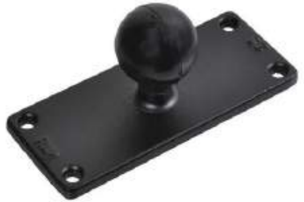
RAM Ball Base 1.5" x 4.5" 4-Hole Pattern