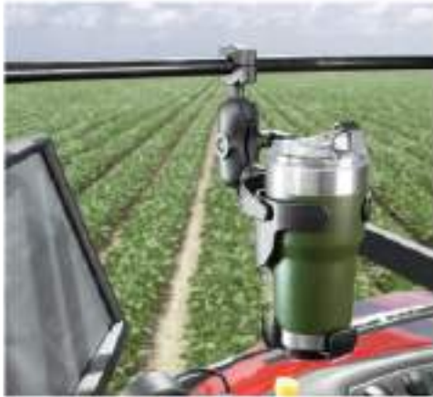
RAM® Level Cup™ XL Socket Arm RAM® Torque™ Mount