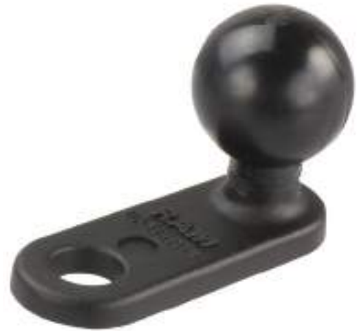
11mm Bolt Head Adapter Mounting Bracket KR-RAMB252U

Hole Pattern: 4-Hole AMPS Plate Size: 2" x 1.7" Ball/Socket Size: 1" Weight Capacity: 0.9kg (2 lbs)