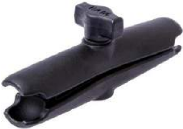
6" (150mm) Long Socket Arm