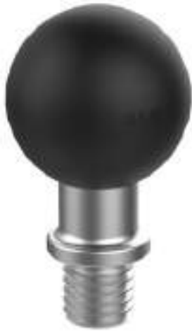
RAM Ball Adapter M10 x 1.5 Threaded Post