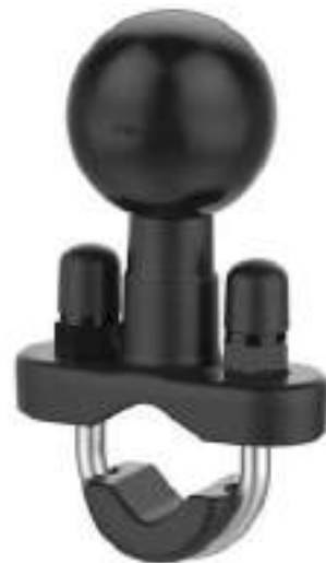
RAM 0.5" to 1" Diameter U-Bolt Base