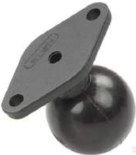
2 Hole AMPS Diamond Plate Adapter KR-RAMC238

Ball/Socket Size: 1.5" Weight Capacity: 1.8kg (4 lbs) Material: Marine-Grade Aluminum