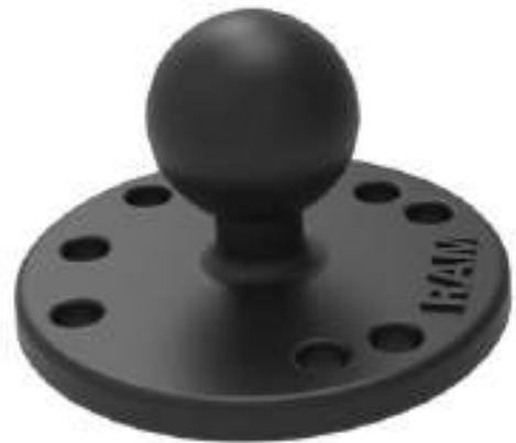
4 Hole AMPS Round Plate Adapter KR-RAMB202

Hole Pattern: 2-Hole AMPS: 1.912" Plate Size: 2.43" x 1.31" Ball/Socket Size: 1" Weight Capacity: 0.9kg (2 lbs)