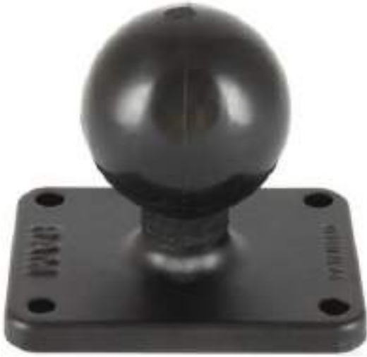
RAM Ball Base 1.5" x 2" 4-Hole Pattern