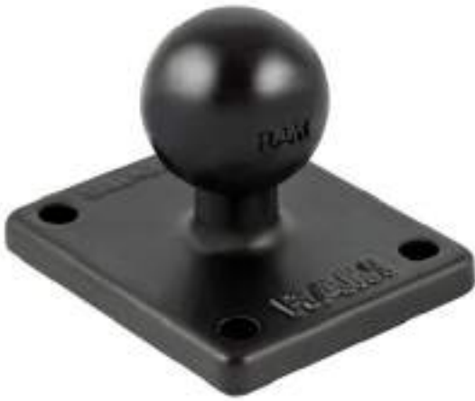
4 Hole AMPS Rectangular Plate Adapter KR-RAMB347U

Hole Pattern: 4-Hole AMPS Plate Size: 2" x 1.7" Ball/Socket Size: 1" Weight Capacity: 0.9kg (2 lbs)