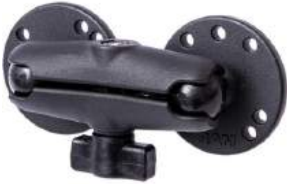
Mount Assy 5" - 4 hole AMPS Round Plate Adaptors KR-RAMB101

Diameter: 1" Weight Capacity: 0.9kg (2 lbs) Total Length: 120.6mm