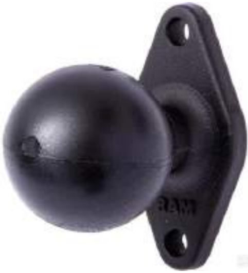
2 Hole AMPS Round Plate Adapter