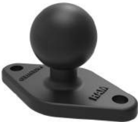
2 Hole AMPS Diamond Plate Adapter KR-RAMB238

Material: High Strength Composite Included: 1 x 3" Double Adhesive Pad, 1 x Alcohol Prep Pad