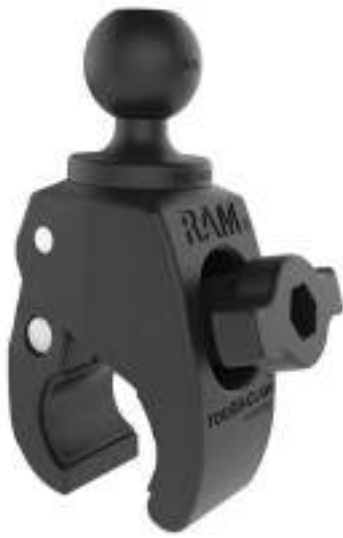
0.625" to 1.14" Diameter RAM Tough-Claw Base KR-RAPB400

Ball/Socket Size: 1" Clamp Range: 0.625" - 1.14" Diameter Weight Capacity: 0.9kg (2 lbs)