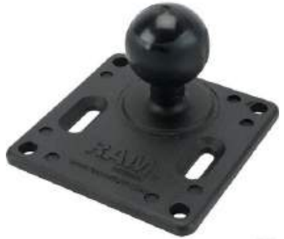
RAM 75 x 75mm VESA Fixing Plate KR-RAMC2461

Ball/Socket Size: 1.5" Plate Size: 1.69" x 2" Weight Capacity: 1.8kg (4 lbs)