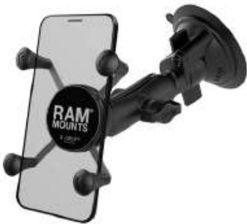
Suction Mount C/W X-Grip Phone Holder KR-RAM-B-166-UN7

Diameter: 1" Weight Capacity: 0.9kg (2 lbs) Total Length: 170mm