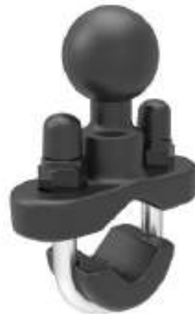
0.5" to 1" Diameter Single U-Bolt Base KR-RAMB231

Ball/Socket Size: 1" Weight Capacity: 0.9kg (2 lbs) Material: Marine-Grade Aluminum