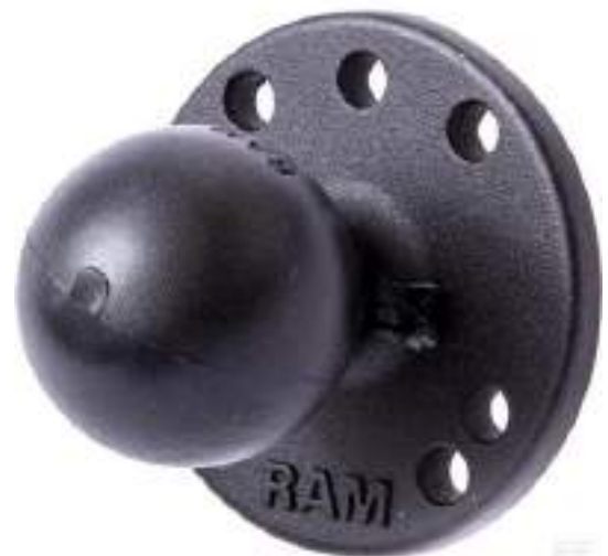
4 Hole AMPS Round Plate Adapter KR-RAMC202

Ball/Socket Size: 1.5" Total Length: 61.7mm Weight Capacity: 1.8kg (4 lbs)